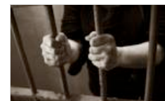
The Supreme Court