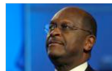
Herman Cain Dares

I'm for reconciliation. Later this week, I'll make that case. But if you choose to fight the